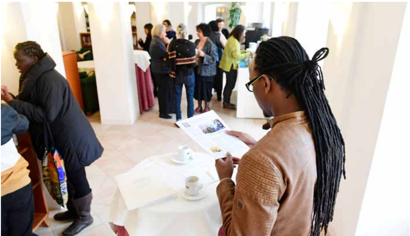
Coffee breaks give Fellows the chance to continue their discussions and read the daily newsletter