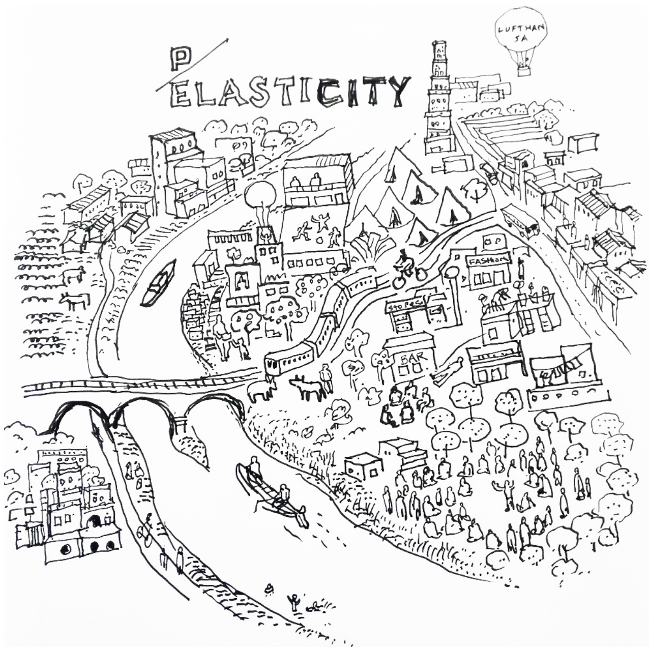
“Elasticity” illustration by Orijit Sen

bus systems in the world. This vast transit network was mapped using a mobile application to collect data on bus routes and timings. This “Mapatón,” a playful participatory event and system based on the concept of gamification, during which 3600 people mapped 2600 bus rides, created for the first time ever a picture of this unique urban infrastructure. The project demonstrates the power of collaborative citizen engagement and what can be achieved when cities, citizens and creatives work together to envision positive change. Technologies can help connect all levels of governments with their citizens; creativity can help invent new ways of mapping informal economies and networks.