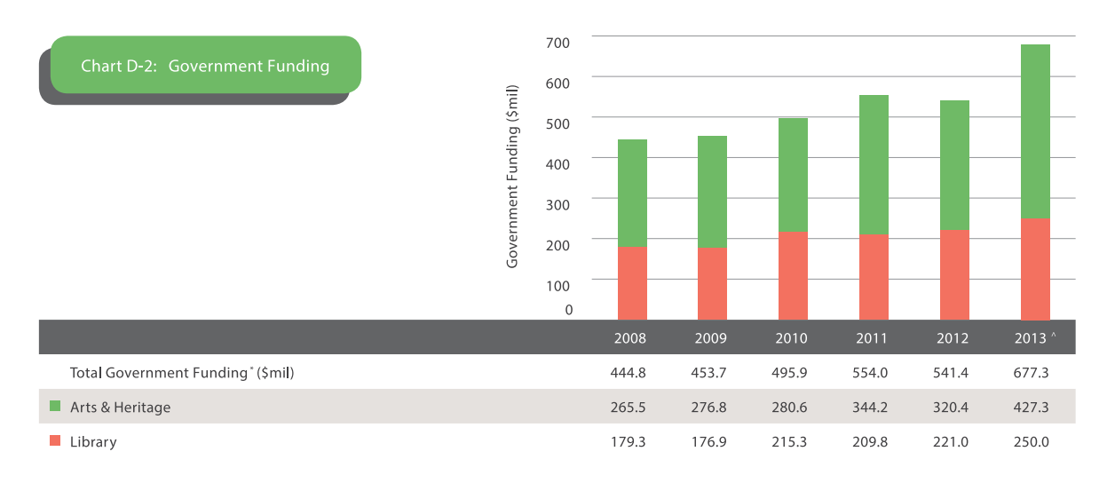
Government funding for arts and culture has continued to grow from $541.4 million in 2012 to $677.3 million in 2013 (Chart D-2).

Source: Ministry of Culture, Community and Youth, and Ministry of Communications and Information. Figures prior to 2012 were from the then Ministry of Information, Communications and the Arts.