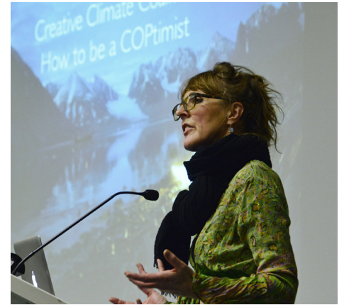
All photos are available on Flickr.com/SalzburgGlobal for download. Non-watermarked photos available on request