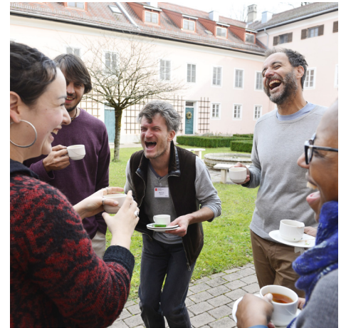
All photos are available on Flickr.com/SalzburgGlobal for download. If you wish to use them, please credit: Salzburg Global Seminar/Herman Seidl