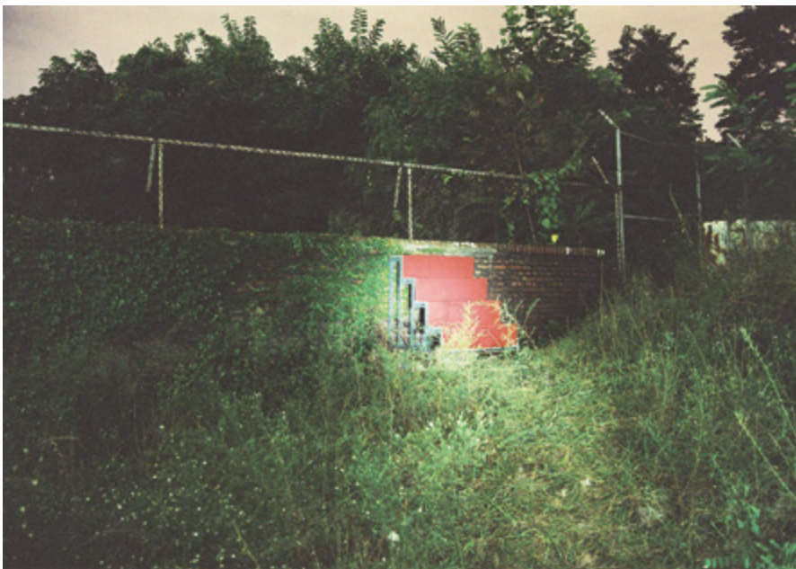
— When artist' collective Part Time Site couldn't find a suitable location to exhibit, they started exploring the public space.