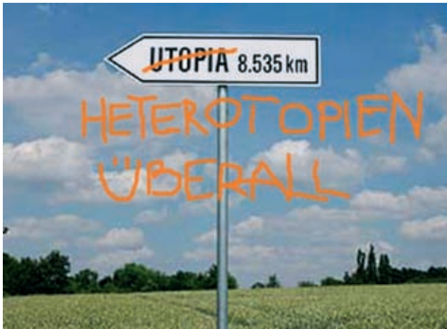
Heterotopia everywhere, (original: Utopia , Klaus Heid; editing: Morgengrün)

Similar to the idea of an archive or a collection of knowledge, Wörterbuch des Krieges (Dictionary of War) also operates as a collaborative platform for creating concepts. At the center of this project conceived by Multitude e.V. are key concepts that have, until now, been neglected or need to be created, invented, assembled. For finding and presenting these terms, formats such as excursions, conferences, blogs, interviews, films, photography, and essays are used. The definition of the concept is not left just to the so-called experts, writers, philosophers, or artists, but is understood as a collaborative process.