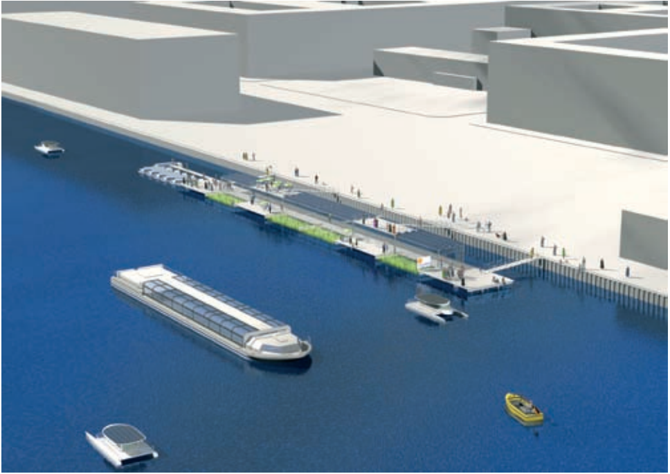
LURI.watersystems, Spree 2011 (3 D visualisation by Sven Flechtenhar @ Luri)

Spree 2011: 7 % of Berlin's surface area consists of water, but there are no places to swim in the city center – leisure activity usually ends at the shoreline. The project Spree 2011 set the goal of making the Spree a river fit for swimming again. It uses a new technology – unique in the world and applicable elsewhere – against the most important polluter of the Spree: untreated mixed water. Until now, through sewer overflow it was washed into the Spree after strong rainfall, but in this project, it would be captured in containers located beneath public pontoons in the water.