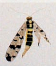
Skorpionfliege aus Reuental. Beide Flügel auf der rechten Seite sind deformiert. Das Abdomen ist mit verschobenen Segmenten aufgeblasen.

Cerci of two earwigs from Gösgen, the left cerci of the left earwig is deformed.