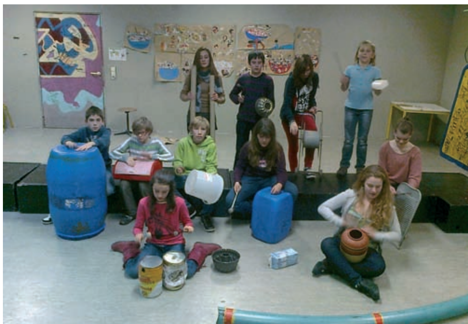
Recycling Orchestra