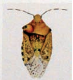
Gartenwanze aus Küssaberg Deutschland. Die Blase mit dem schwarzen Auswuchs verändert die Form des Halsschildes.

Scorpionfly from Reuental. Both wings on the right side are deformed and the abdomen looks blown up and deformed.