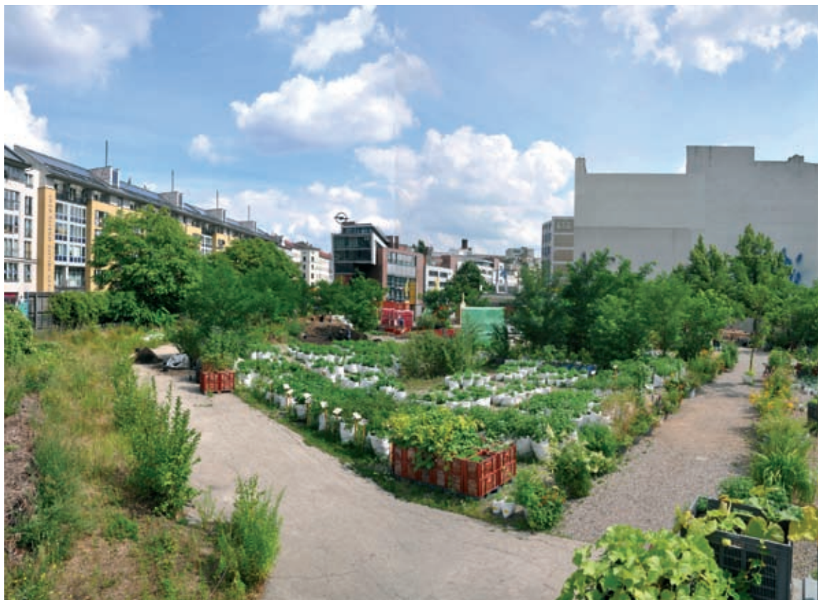
Temporary gardens: Prinzessinnengarten by Nomadisch Grün

underprivileged residents, using donated, reusable materials like railroad ties, bricks, building timber, tires, bales of hay, bottles, and corrugated cardboard. To date, 20 buildings have been erected in this way. “Using their own imagination and efforts, the students are able to create a different reality: architecturally, socially, politically, ecologically, and aesthetically. That is the mission of Rural Studio.” 35