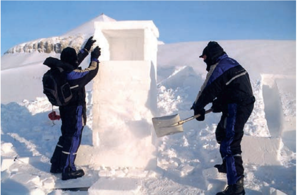
Peter Clegg and Antony Gormley, Three Made Places, 2005

logical creativity, between practicability and idea. The show is accompanied by workshops with children and young people, panels with representatives from the worlds of art, science, foundations, the business community, and NGOs, as well as a film program. This exhibition exemplifies the need of a Fund for Aesthetics and Sustainability.