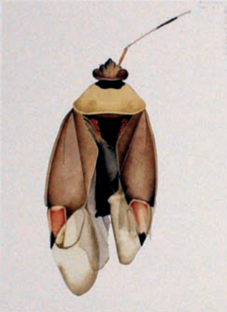
Die Flügel dieser Weichwanze aus Rohr sind ungleich lang. The wings of this soft bug from Rohr are asymmetrical.

In 1988, the artist collected true bugs and other insects around the Swiss nuclear power plants Gösgen and Leibstadt in the canton of Aargau. She did not at that time collect the same number of insects at the different research points. Nonetheless, she was horrified by the heavy deformation she found and decided to go on with this research.