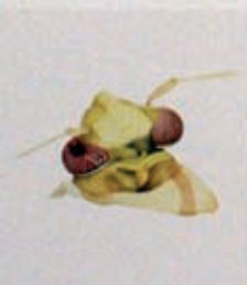
Kopf einer Weichwanze aus Schönenwerd. Aus dem Auge wächst eine Zyste und die Facetten sind unregelmäßig und zum Teil zu groß.

Head of a soft bug from Schönenwerd. A growth out of the left eye and disturbance of the facets are visible.