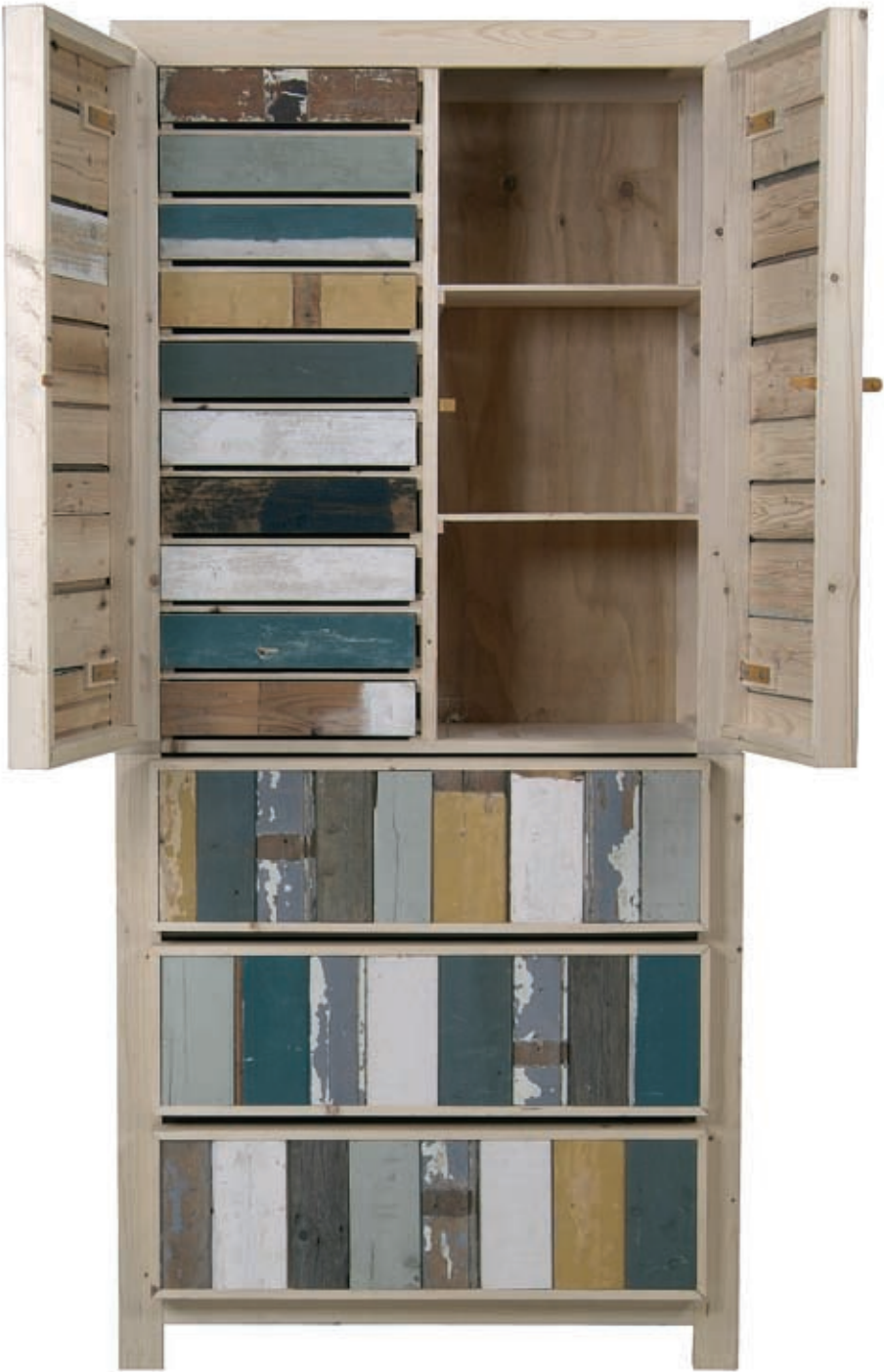
Piet Hein Eek, Design Furniture From Scrap Wood 28