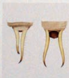
Cerci von zwei Ohrwürmern aus Gösgen, der Linke des linken Ohrwurms ist deformiert.

Head of a soft bug from Schönenwerd. A growth out of the left eye and disturbance of the facets are visible.