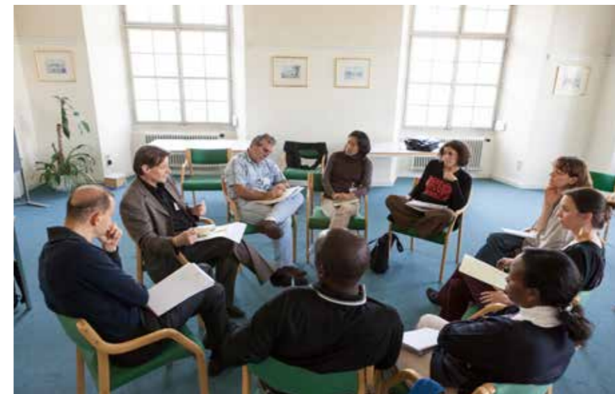
Project Group I