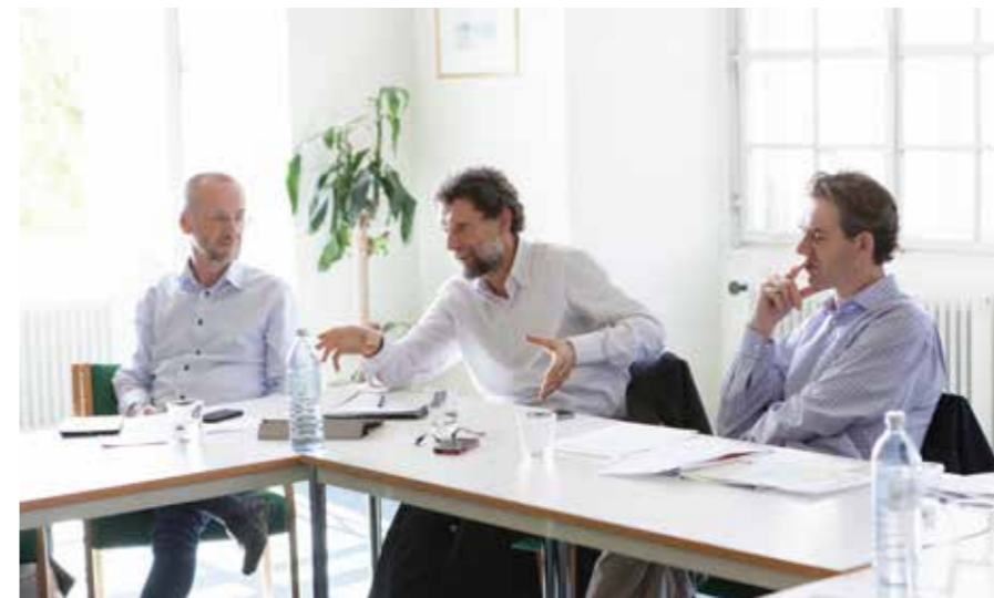
Project Group II