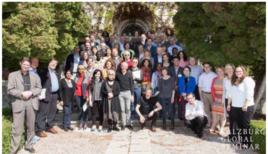
Participants of Session 532

The Fellows have already embarked on a number of collaborative projects, inspired by their interactions in Salzburg. As an institution founded to promote peace and dialogue between former enemies in the wake of the Second World War, Salzburg Global looks forward to continuing the work in the area of conflict transformation through culture that was inspired by this program in April 2014.