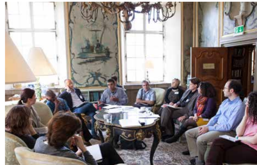
Project Group IV