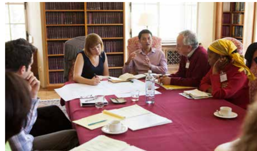
Project Group V

As part of this model for youth, we need to take a look at healing and elicit that the young people themselves, what it means to heal and what they need, rather than having adults telling them what they need. It is important to see who is left out of the dialogue; the Native American perspectives, Aboriginal communities, or Bedouins, who often pass on ancient wisdom inter-generationally